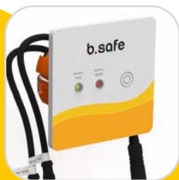
b.safe Mini-Display DLC Wall 1-channel Cat. No. R 658-03