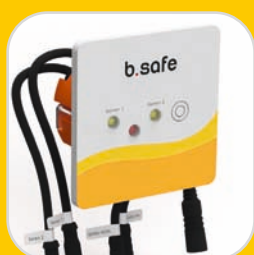
b.safe Mini-Display Splitter Wall, 2-channel Cat. No. R 658-04