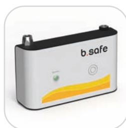
b.safe Mini-Display Table 1-channel Cat. No. R 659-01