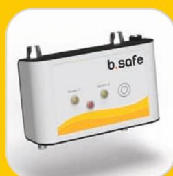
b.safe Mini-Display Splitter Table, 2-channel Cat. No. R 659-04