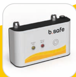
b.safe Mini-Display DLC Table 1-channel Cat. No. R 659-03