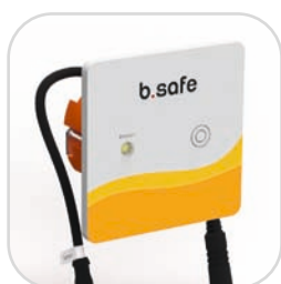
b.safe Mini-Display Wall 1-channel Cat. No. R 658-01