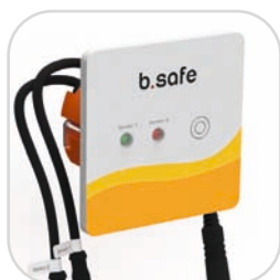
b.safe Mini-Display Wall 2-channel Cat. No. R 658-02