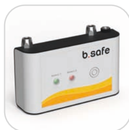
b.safe Mini-Display Table 2-channel Cat. No. R 659-02